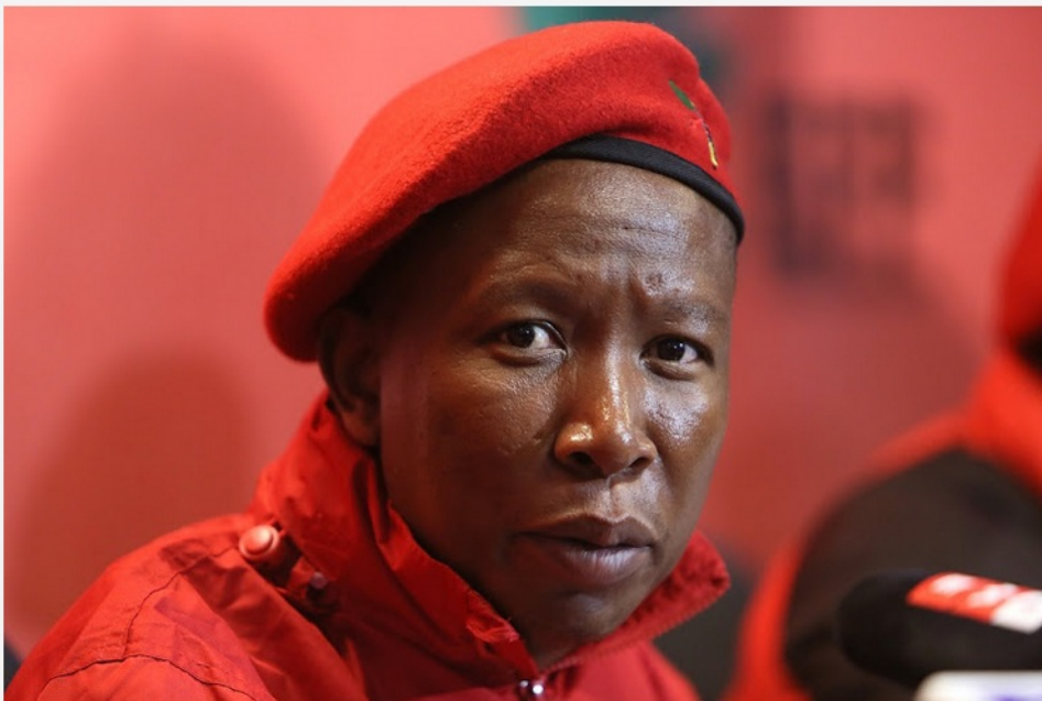
EFF leader Julius Malema. File photo.