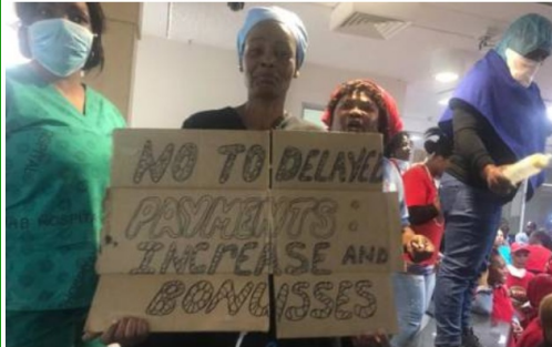
FILE: One of the protesters holding a placard during demonstrations over wages at the Charlotte Maxeke Academic Hospital in Johannesburg on 31 May 2018.

In May, hundreds of workers shut down the hospital over unpaid bonuses.